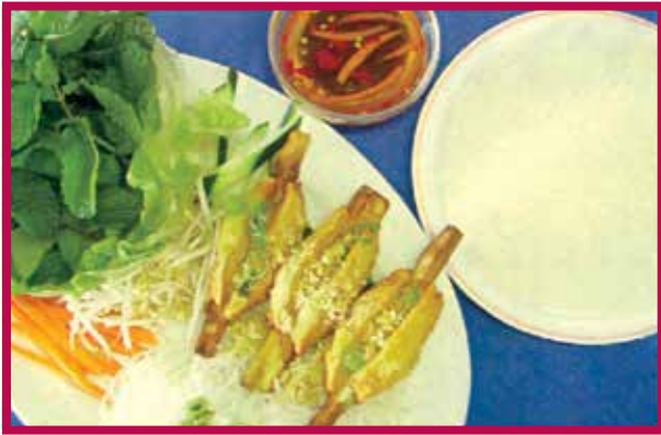
Sugar Cane Prawn Vermicelli Rice Paper Wrap 22.50 (Fresh Salad, Peanuts & special Fish Sauce) D.I.Y.