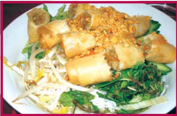
Spring Roll vermicelli Salad 15.50 (with peanuts & special fish sauce dressing)