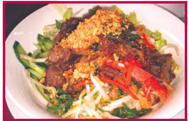
Grilled Beef Vermicelli Salad 16.50 (with peanuts & special fish sauce dressing)