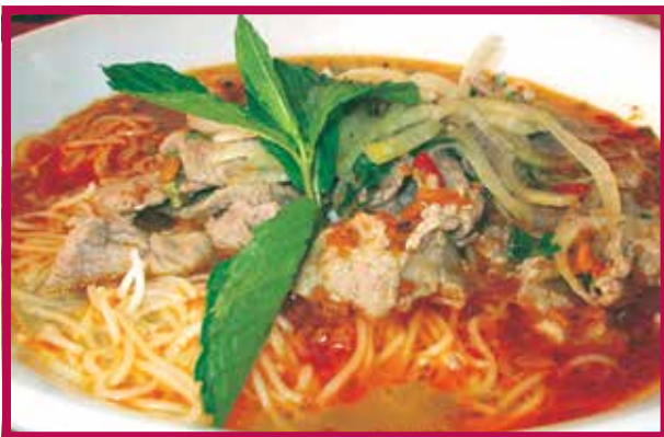
Spicy Beef Vermicelli Soup (Bun Bo Hue) 16.50 OR Beef Ho-fun Soup (non spicy) PHO 16.50 Chicken Pho (chicken w Vermicelli Soup) 16.50