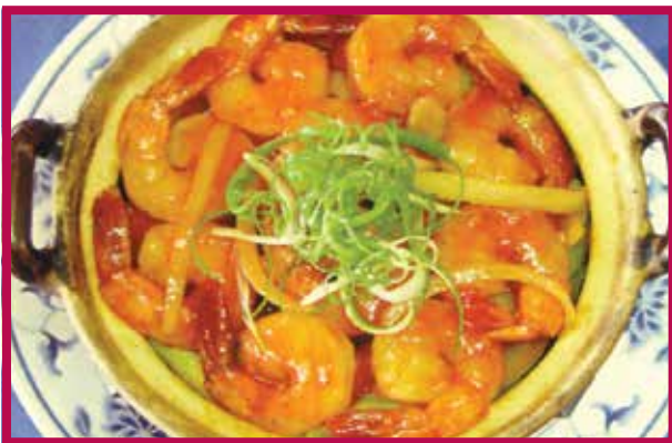
Melin's Special King Prawn Hot Pot 26.50 (Tomato based sauce: non spicy) (spicy - extra 50c) Tom Yum Seafood Hot Pot 26.50 (Spicy: mild, medium OR hot)