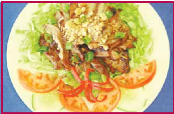
Special tasty Grilled Chicken 19.50 (served with lettuce, tomato, cucumber & peanuts)