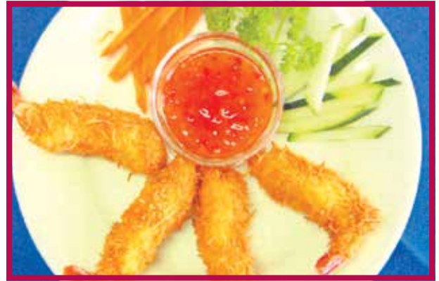
Coconut King Prawns 13.00 (served with sweet chilli sauce) (4)