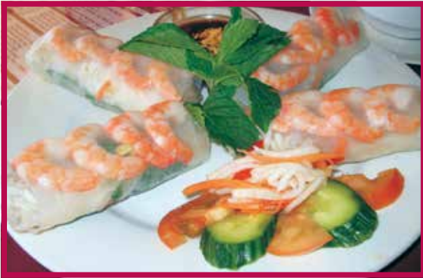
Transparent Prawn & Pork Rice Paper Rolls 14.00 (vermicelli Noodles, Fresh Salad, Peanuts & Hoisin Sauce) (4)