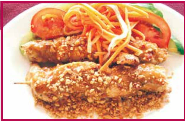
Satay Chicken Skewers 8.00 (with mild, spicy peanut sauce) (2)