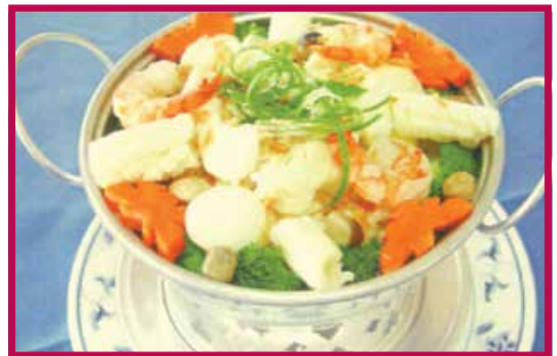
Seafood Steamed Boat (sml - 26.50, Lge - 45.00) Spicy Tom Yum (sml - 28.50, Lge - 48.00) (Spicy: mild, medium OR hot) (This dish is with home brewed stock that has slow cooked for hours)