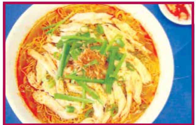
Spicy Tom Yum Chicken Noodle Soup 16.50 OR Combination (meat & seafood & vegies) 20.50 OR Seafood OR King Prawns 20.50