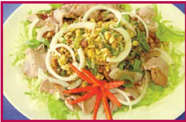
Sliced Beed with ginger, hoisin, fish sauce 19.50 (warm Dish with lettuce, onion, mint & peanuts)