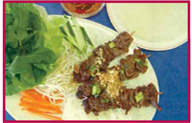
Beef Skewers Vermicelli Rice Paper Wrap 19.50 (Fresh Salad, Peanuts & special Fish Sauce) D.I.Y.