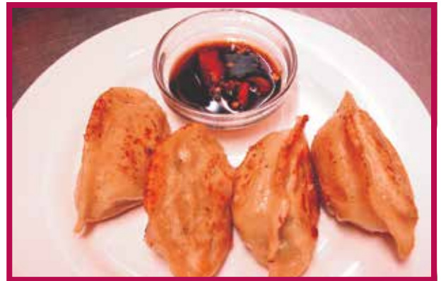
Deep Fried OR Steamed Pork Dumplings 8.00 (served with soy sauce) (4)