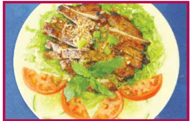
Special tasty Grilled Pork Chop 19.50 (served with lettuce, tomato, cucumber & peanuts)